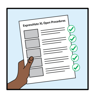
Review your ExpressVote XL Open Procedures