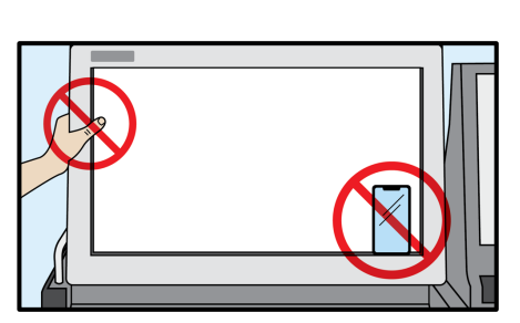
Nothing resting on the screen