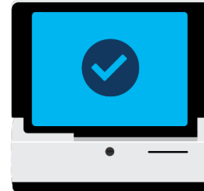
DS300® Poll Place Scanner and Tabulator

Like all ES&S ballot tabulation equipment, the purpose-built poll place scanners and tabulators (DS200 and DS300) maintain the highest levels of physical and digital security controls. These paper-based systems maintain paper vote records and take digital images of each processed ballot.